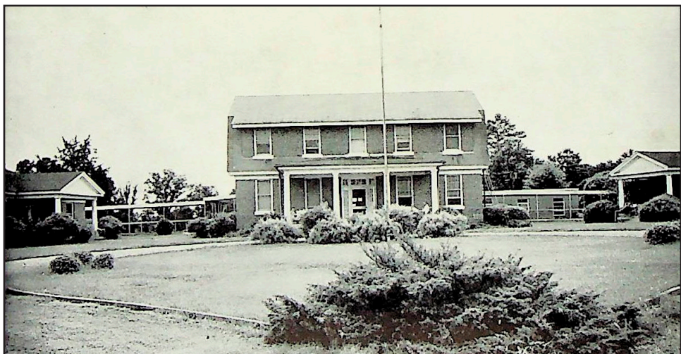
Main Building, Lowman Home